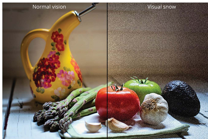
Figure 1 Illustration of visual snow

The study was approved by the KCL Research Ethics Panel. Data were collected between April 2016 and May 2018.